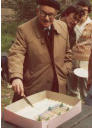
Jerzy Neyman 80th birthday 1974