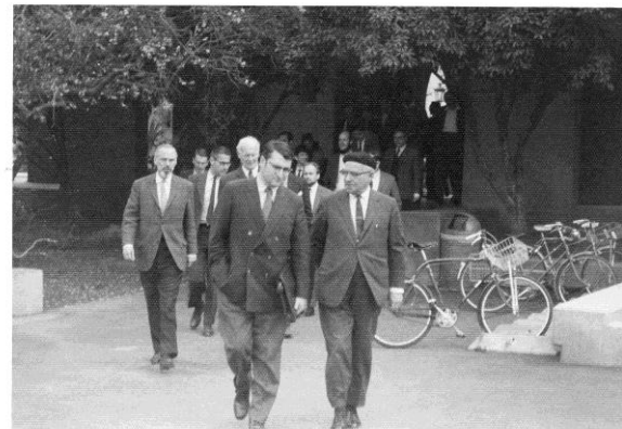
Some statisticians I met in Berkeley (1968-69):