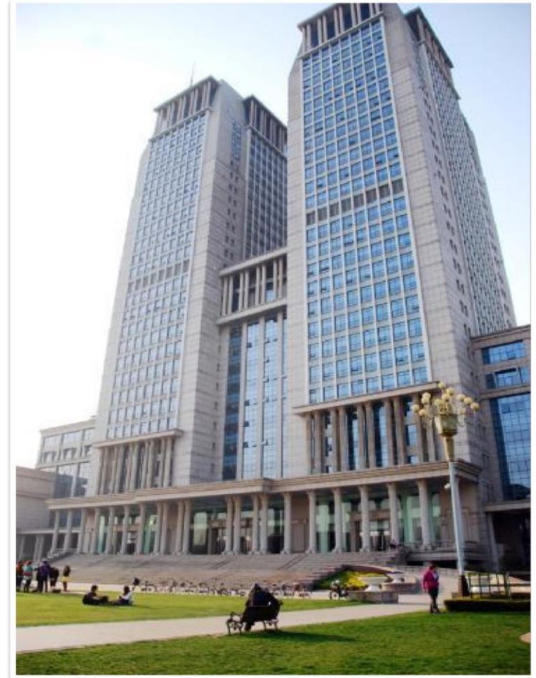
Guanghua Towers in Fudan University

FOR MORE INFO: http://www.fudan.edu.cn/englishnew/