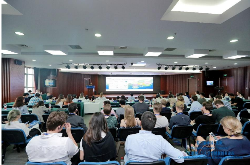
2019 Sino-Nordic "Internet +" College Students Innovation and Entrepreneurship Forum Business idea pitching competition.

The course is designed for Master level students, but graduating Bachelor students may also be enrolled. Each Nordic Centre member university can nominate three students for the course.