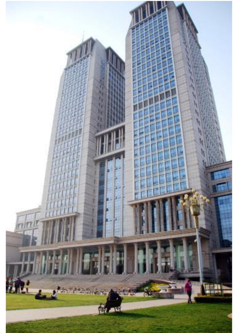
Guanghua Towers at Fudan University