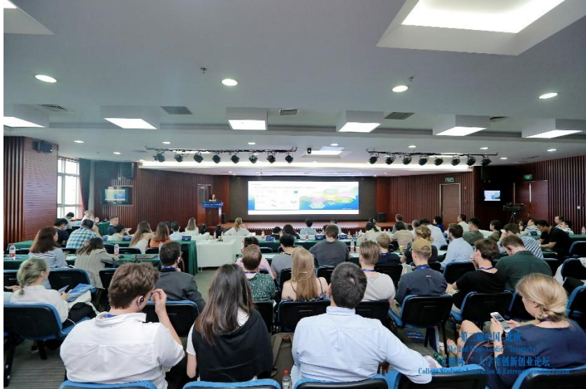
2019 Sino-Nordic "Internet +" College Students Innovation and Entrepreneurship Forum Business idea pitching competition.

The course is designed for Master level students, but graduating Bachelor students may also be enrolled.