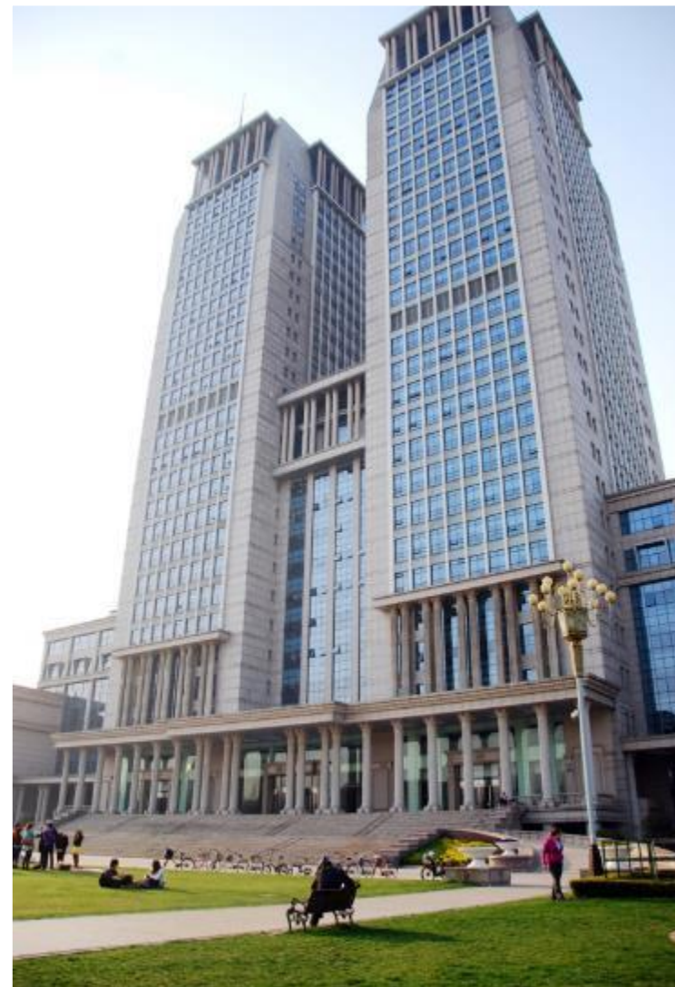
Guanghua Towers at Fudan University