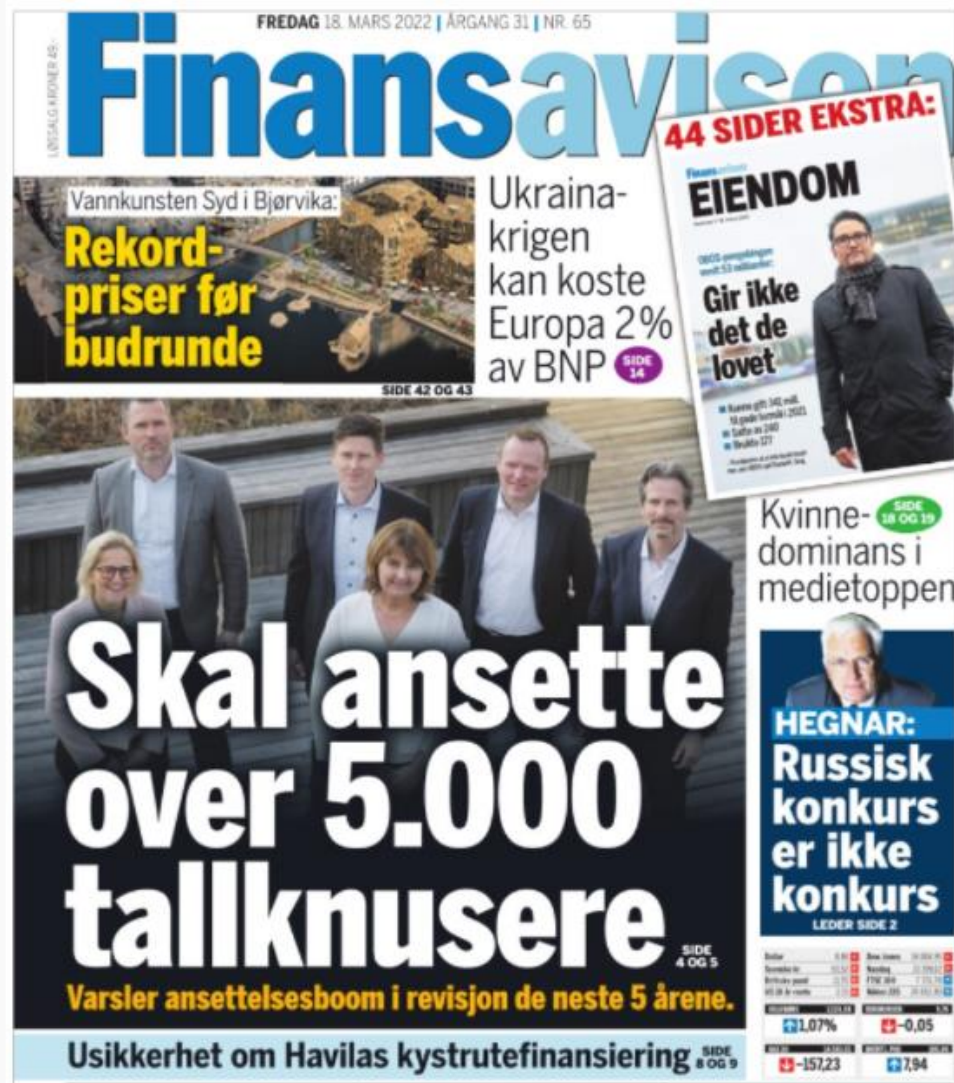
Finansavisens forside 18. mars 2022.